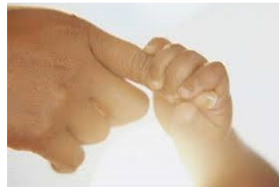
Parent & Child Dedication Mothers Day | Sunday, May 13th

Children Ministry offered during Sunday Worship Services: